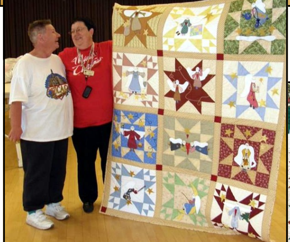
Raffle quilts are an excellent way to pay for blanket-making supplies. LPGs raffle quilts are exceptional and these lucky winners know it!